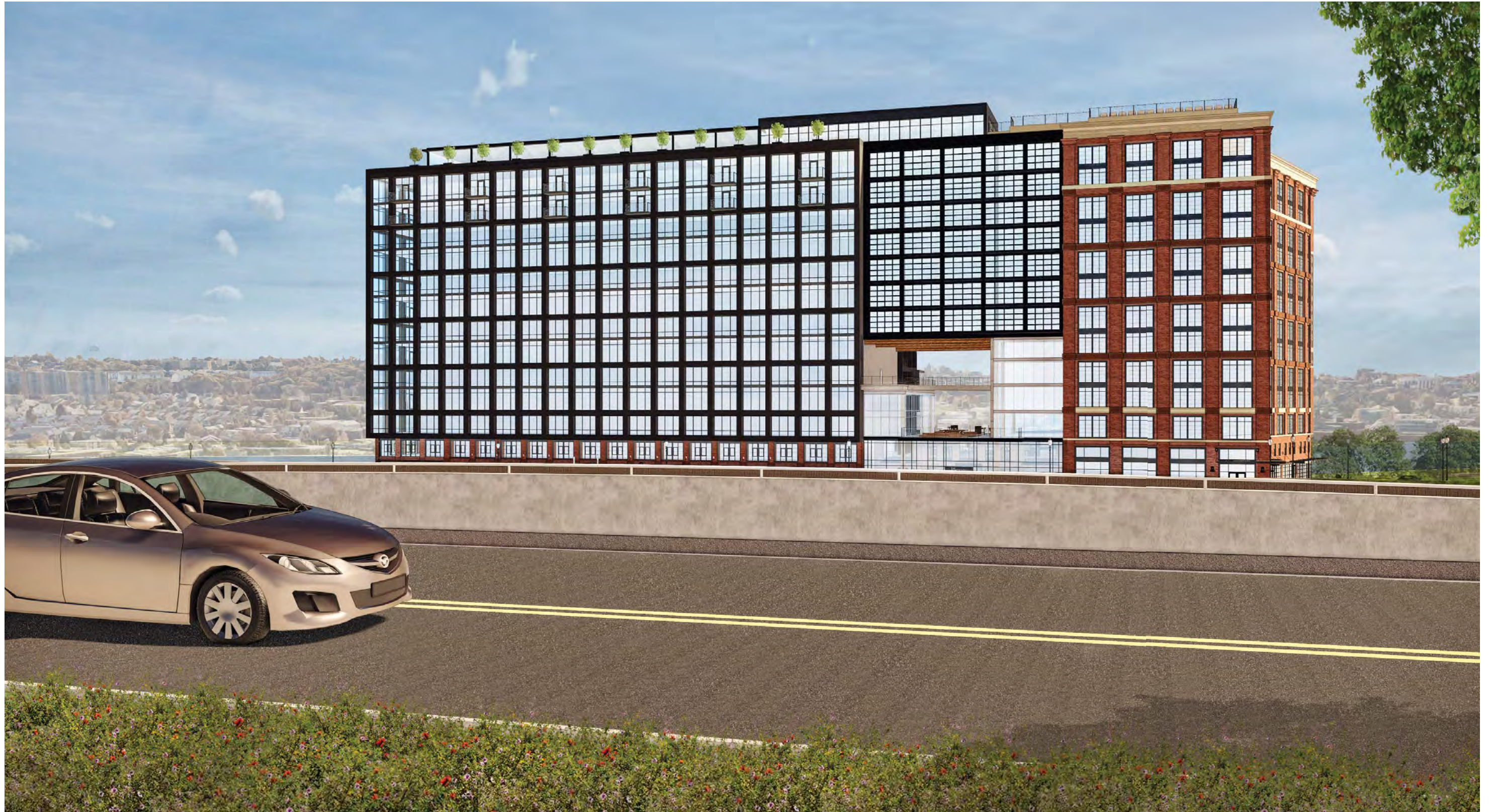
1 M STREET FACADE VIEW FROM L STREET SCALE: NOT TO SCALE