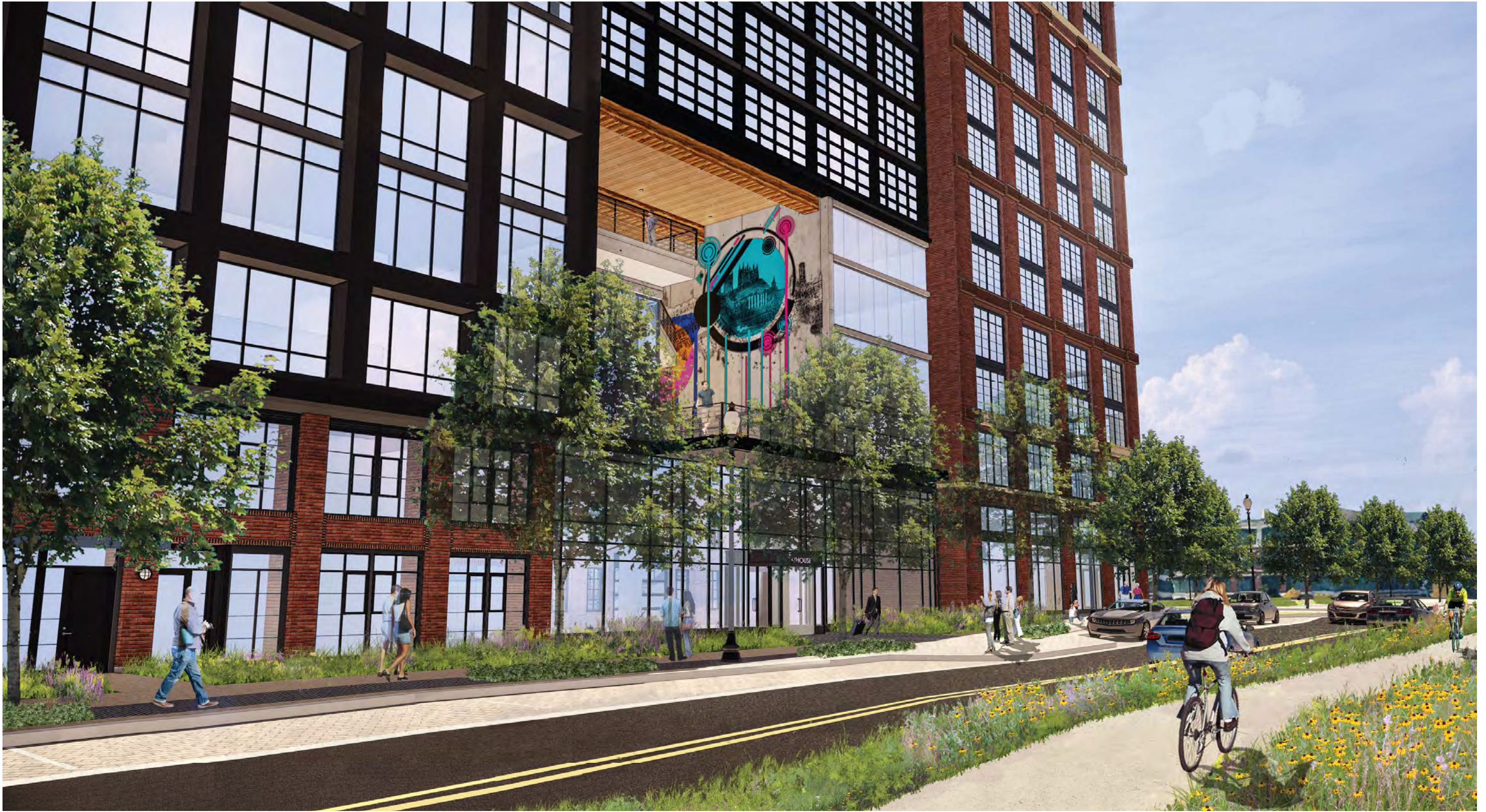
1 EAST TOWER MAIN LOBBY ENTRANCE AT M STREET SCALE: NOT TO SCALE