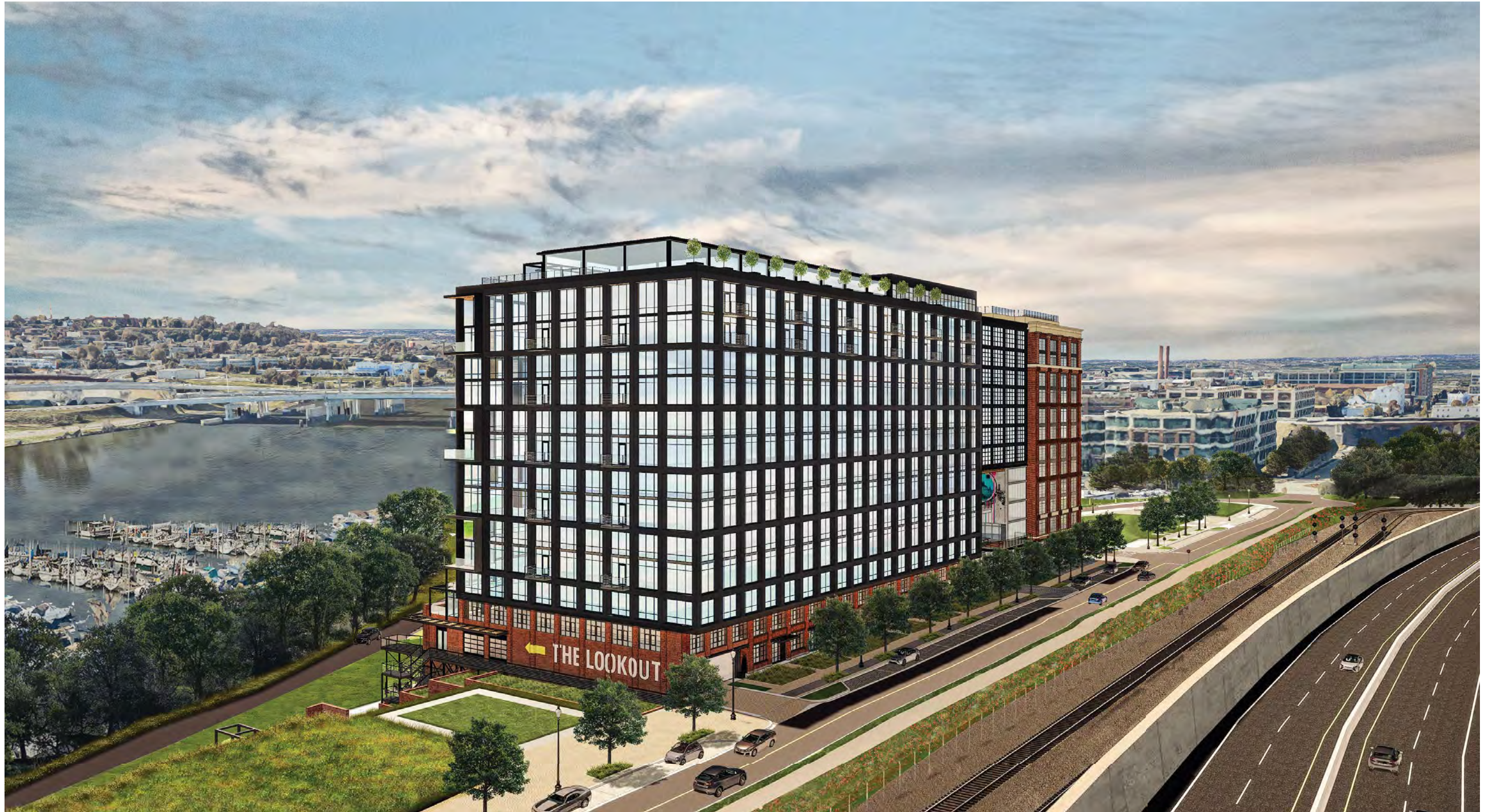
1 VIEW SOUTHWEST AT M STREET AND WATER STREET SCALE: NOT TO SCALE