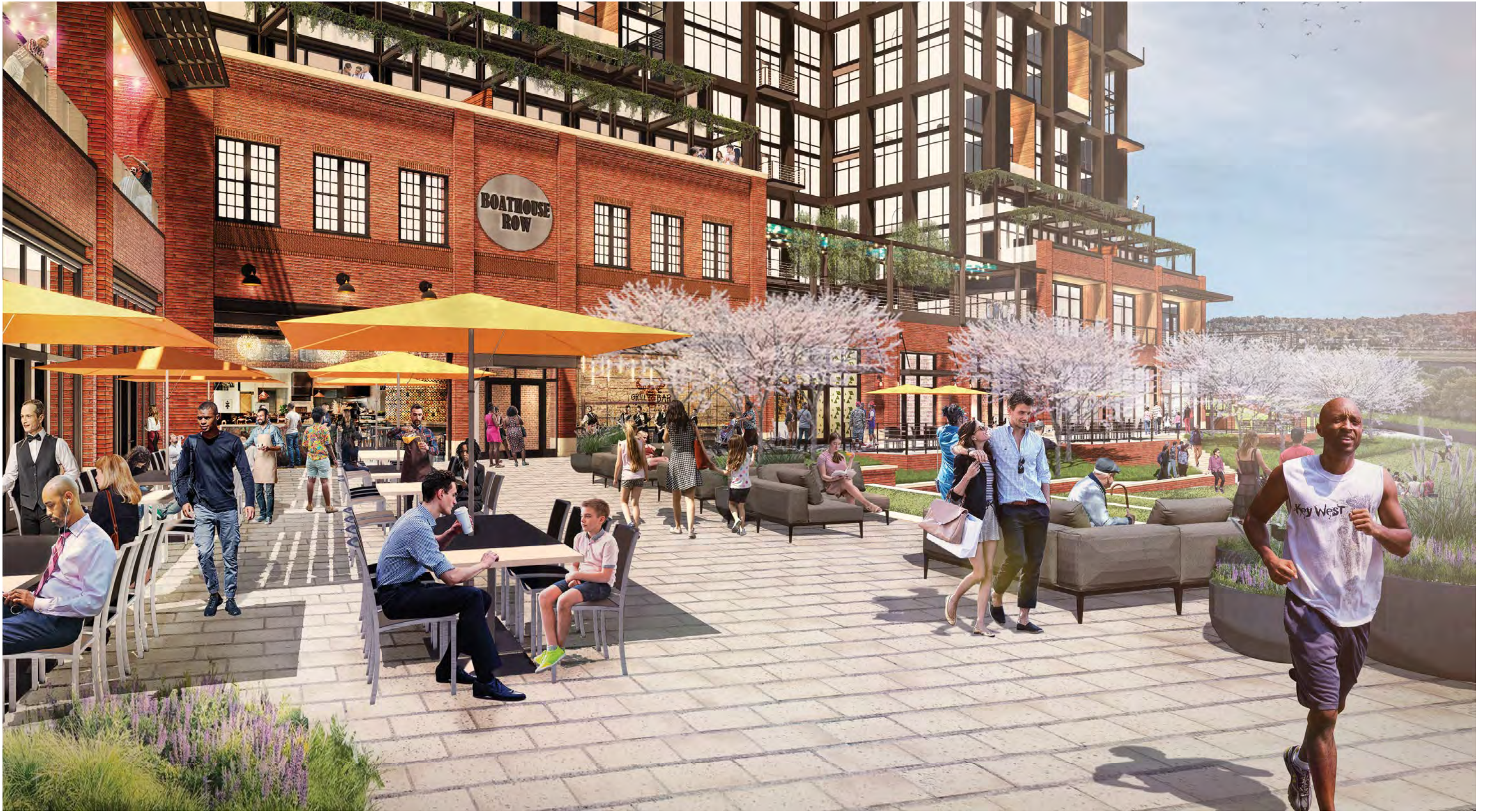
1 VIEW OF WATER STREET LOWER RETAIL PLAZA SCALE: NOT TO SCALE