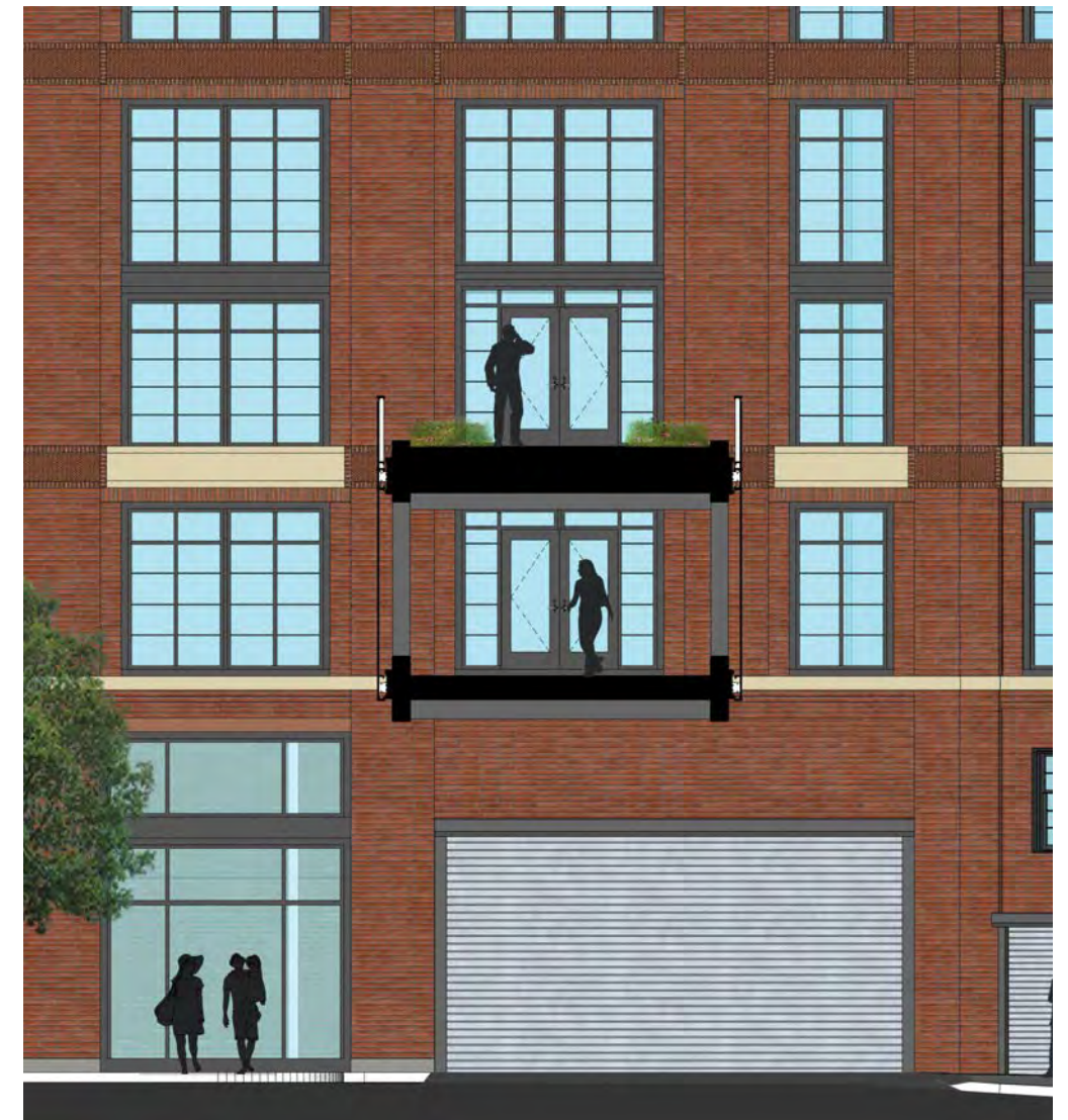
2 SECTION OF BRIDGE CONNECTION SCALE: NOT TO SCALE