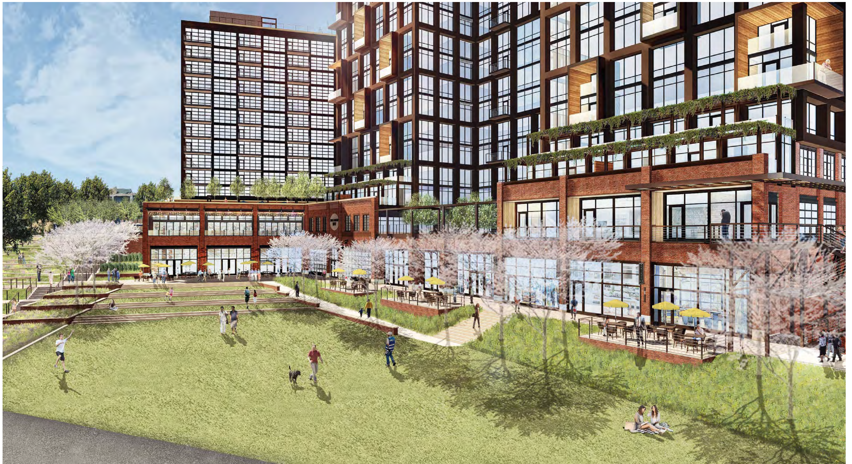
1 VIEW OF LOWER RETAIL PLAZA AND GREAT LAWN SCALE: NOT TO SCALE