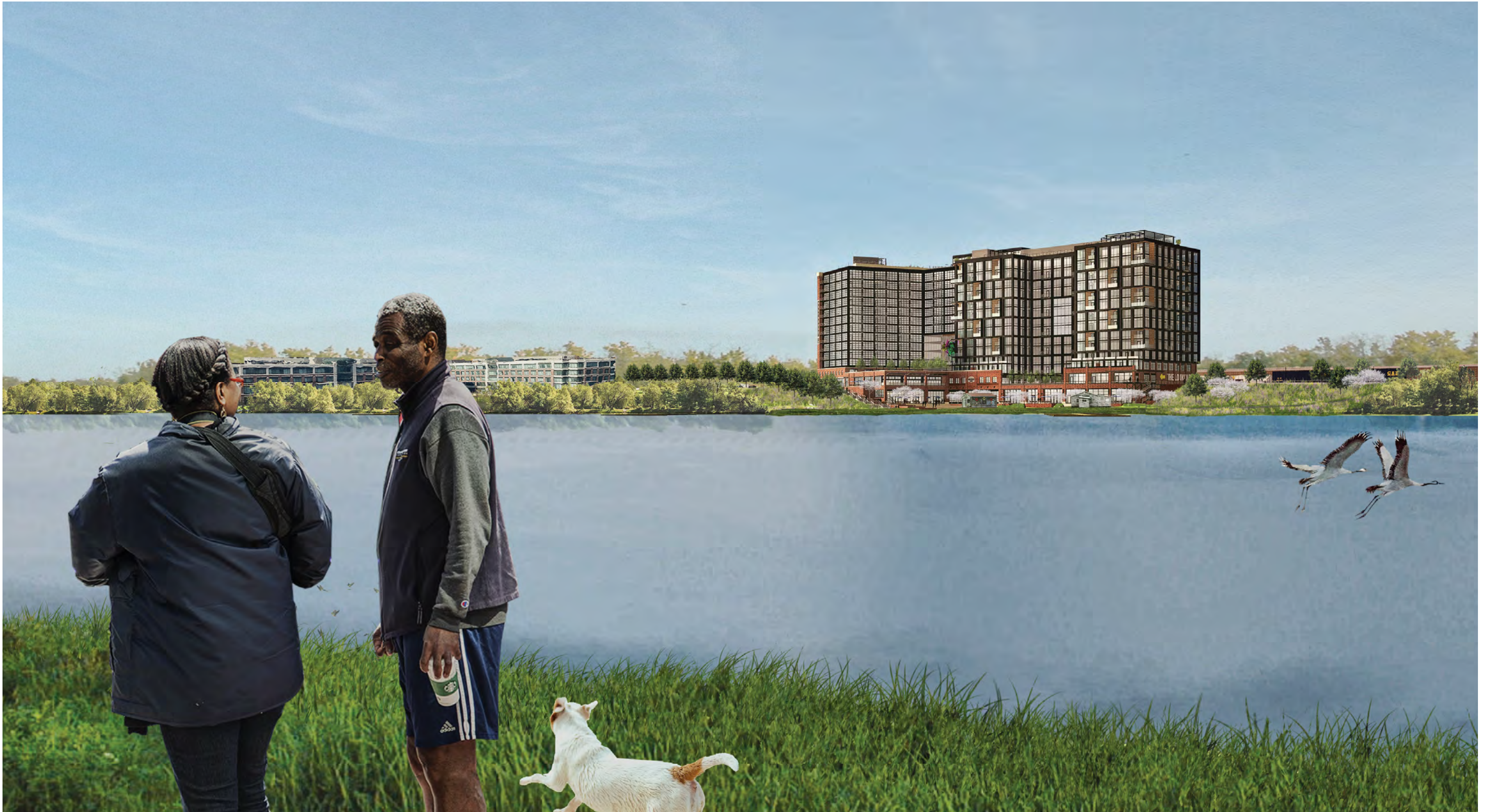
1 VIEW FROM ANACOSTIA WATERFRONT PARK SCALE: NOT TO SCALE