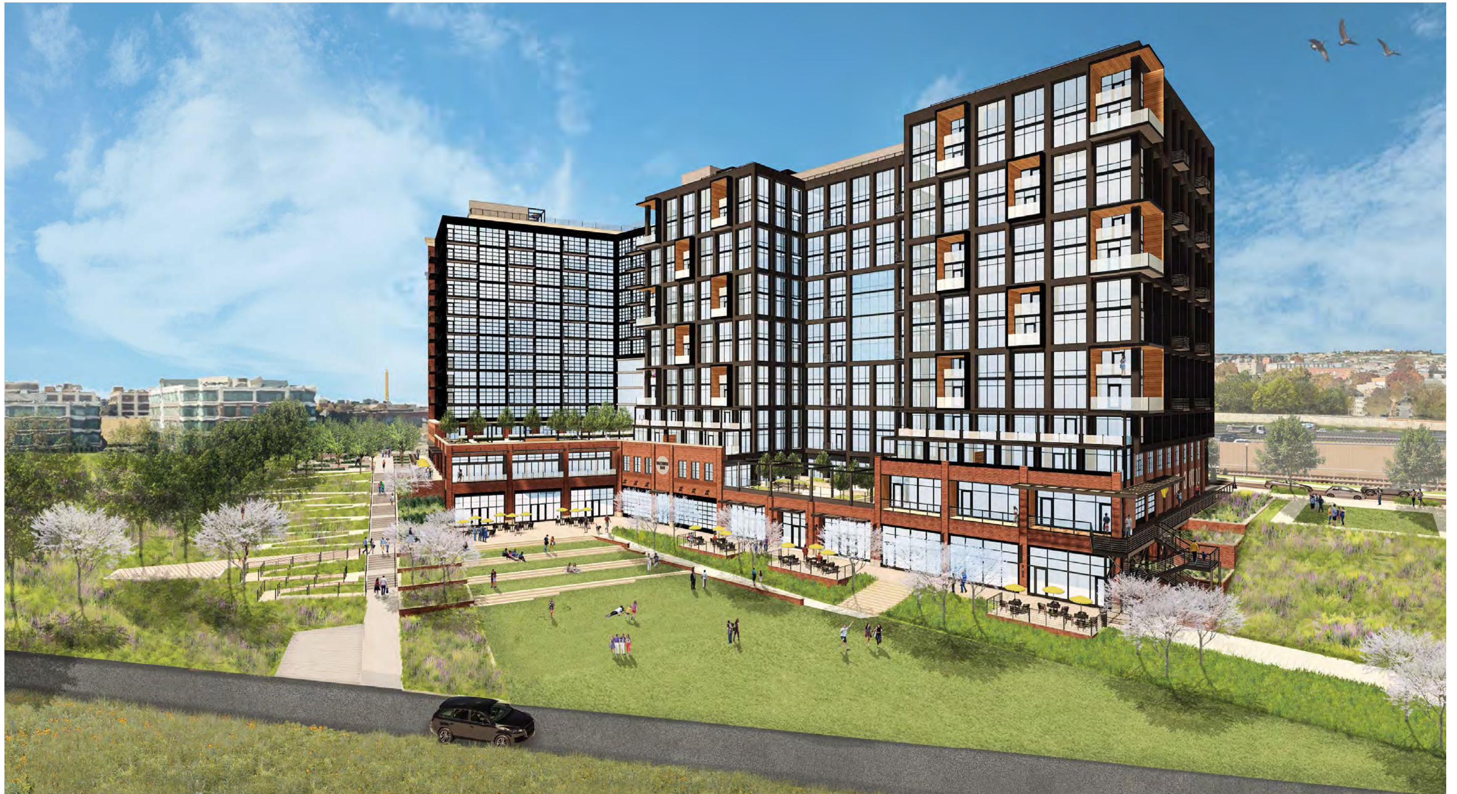
1 WATER STREET VIEW TOWARDS NORTHWEST SCALE: NOT TO SCALE