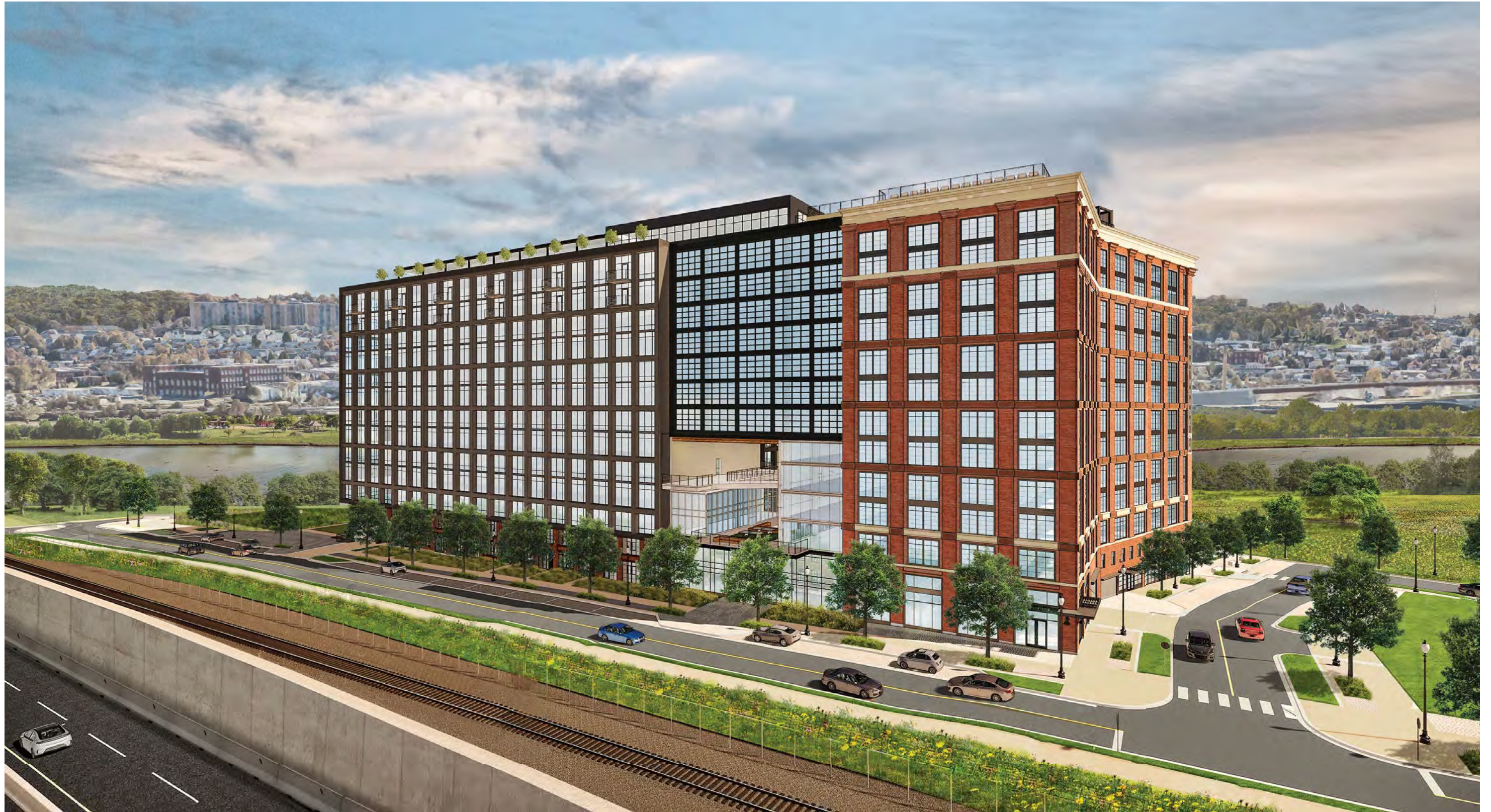
1 M STREET FACADE VIEW SCALE: NOT TO SCALE