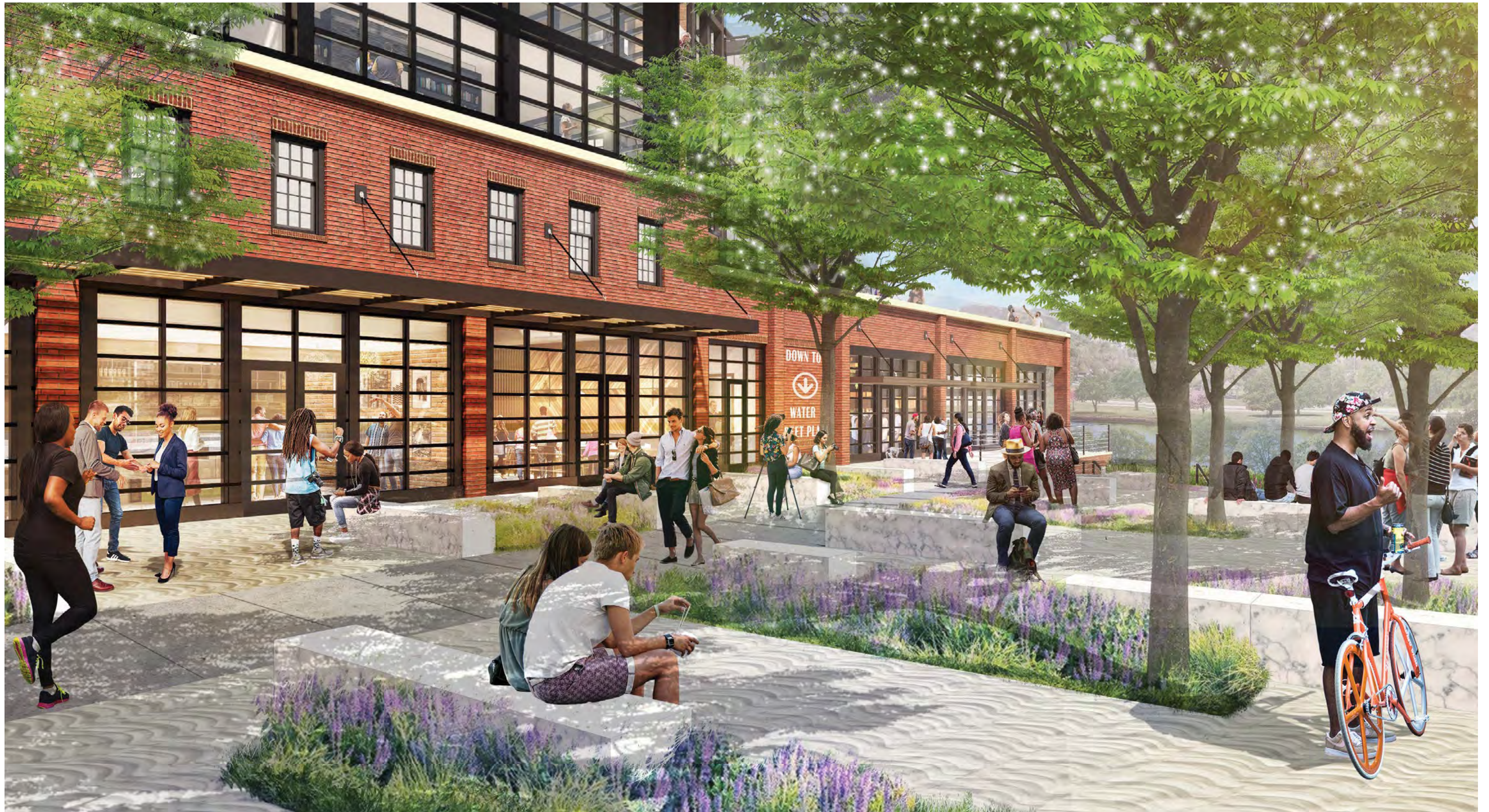
1 VIEW ALONG VIRGINIA AVENUE UPPER RETAIL PLAZA SCALE: NOT TO SCALE

NOTE: SELECT TREES NOT SHOWN. PLEASE REFER TO LANDSCAPE PLANS FOR PROPOSED DESIGN.