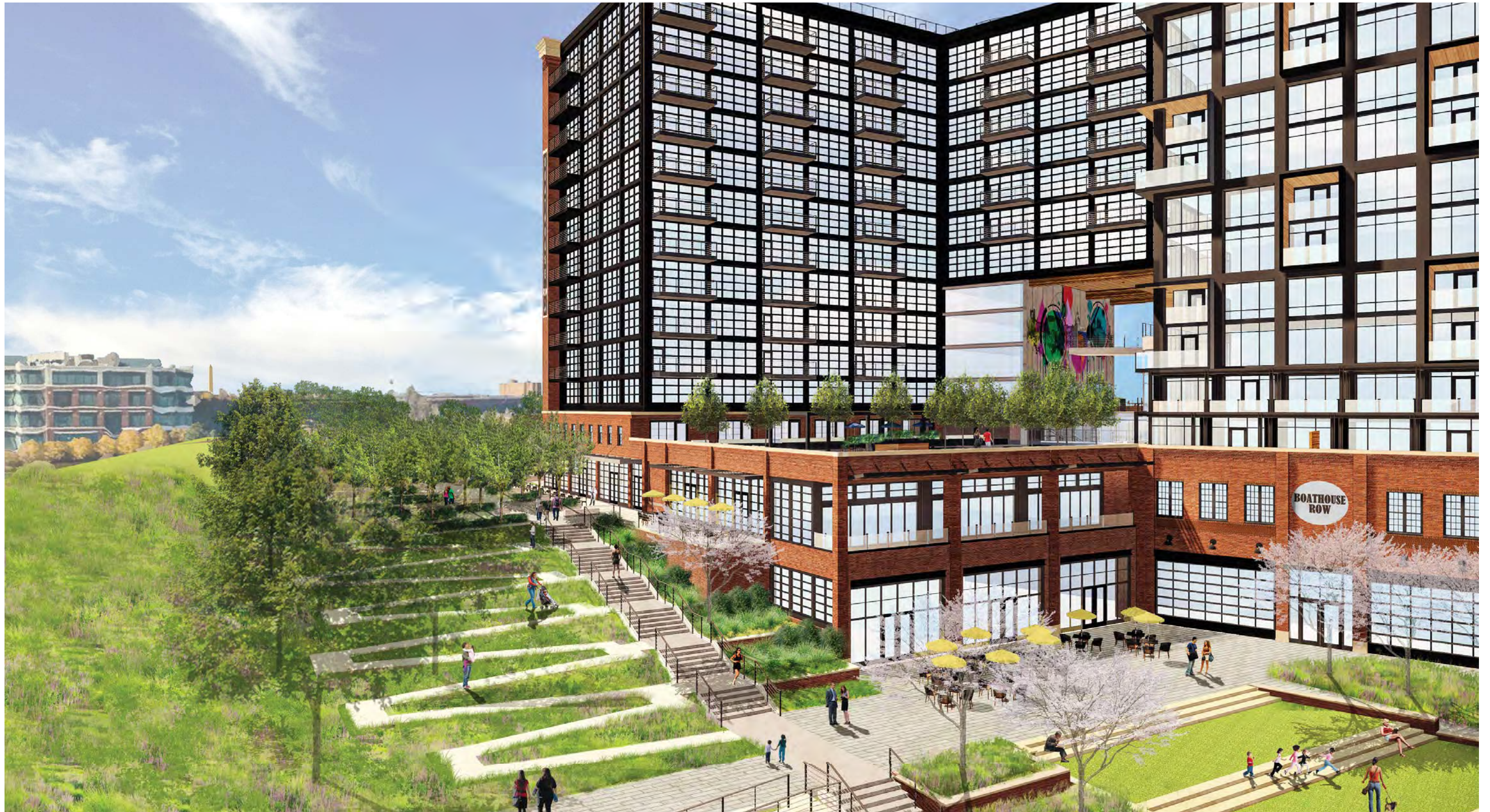
1 VIEW ALONG VIRGINIA AVENUE PROMENADE SCALE: NOT TO SCALE