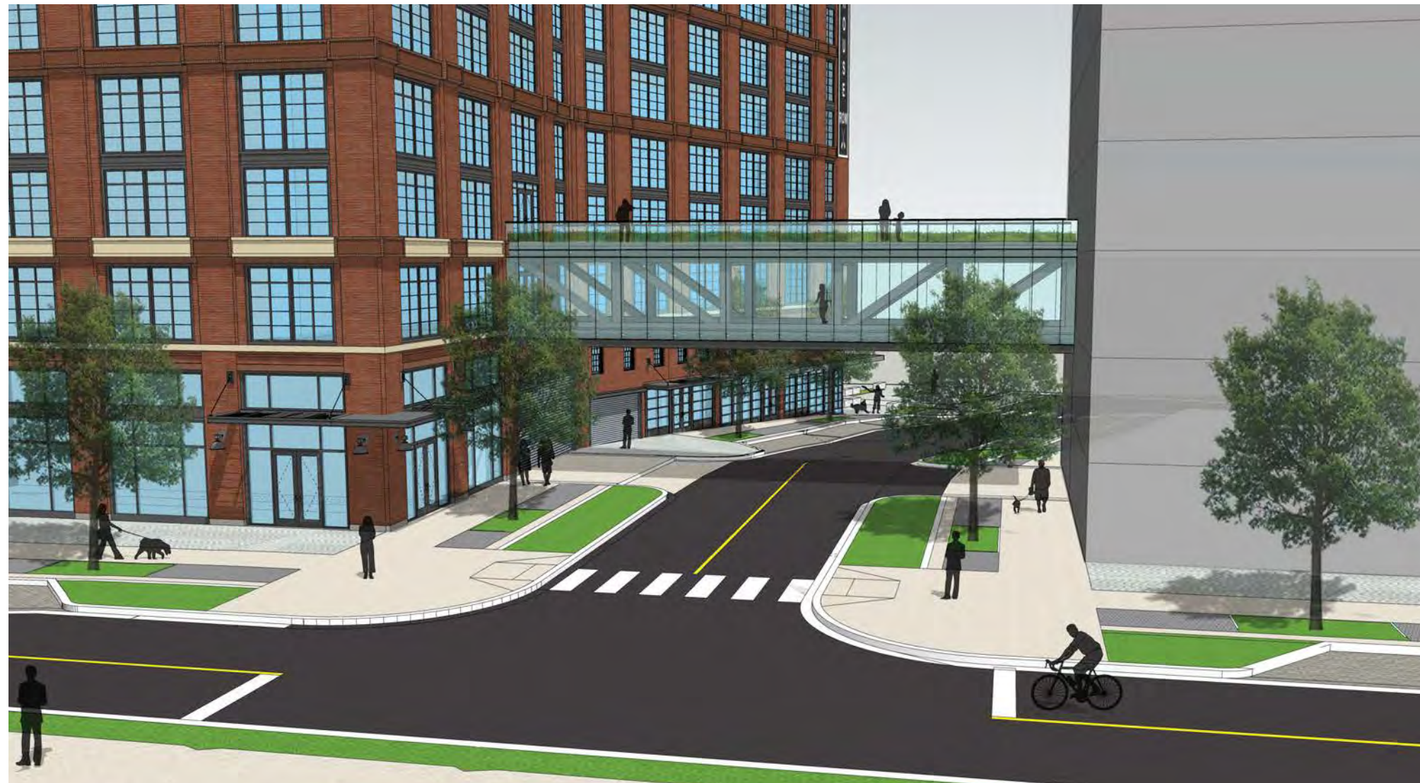
1 VIEW OF BRIDGE CONNECTION SCALE: NOT TO SCALE